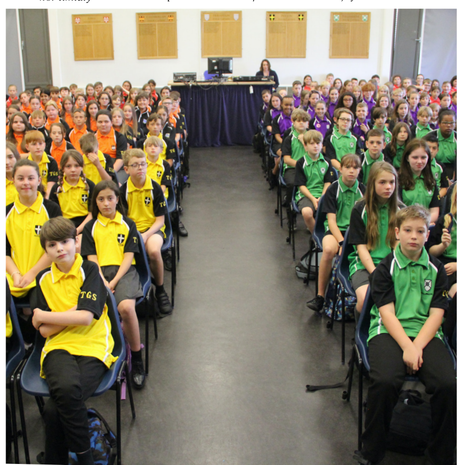
I trust and am contented